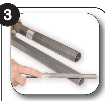
Round off all sharp edges and remove burrs.

Remove guard from driveline. Separate driveline halves. Shorten guard halves (Pic. 1) and profile tube halves (Pic. 2) same as existing driveline halves or see example below.